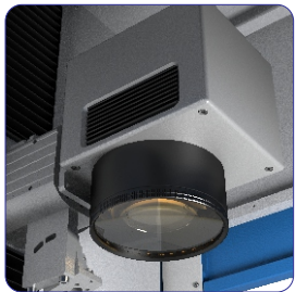
7000mm/s Speed The galvanometer motor provides stability, accuracy and fast marking speed.