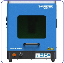
Protective Windows Tempered glass viewing windows