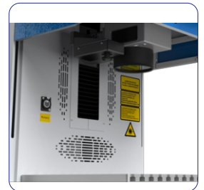
Auto Focus Precision optics to achieve a fast and precise focus.