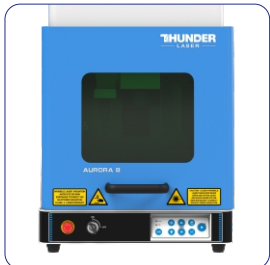
Protective Windows Tempered glass viewing windows