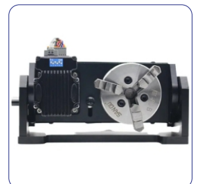
Rotary Capabilities With an added rotary you can engrave cylindrical items.