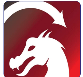
Lightburn software Better software for laser cutters.